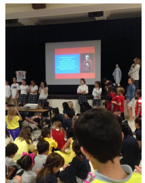
St. Agnes School, Arlington has a WMR Dress Day