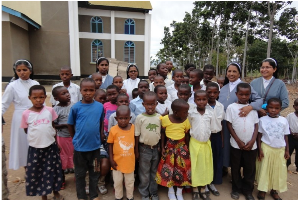
Sisters of Saint Charles Borromeo and the children they serve in Tanzania

The Sisters also serve the local orphan community—many children in the area have lost their parents to HIV/AIDS and need physical and emotional support. They receive many things because of MCA's support of the Sisters: school uniforms and educational materials; basic hygienic items; food and clothing; and most importantly, the loving care of the missionary Sisters.